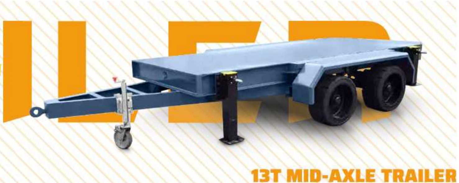
13T MID-AXLE TRAILER