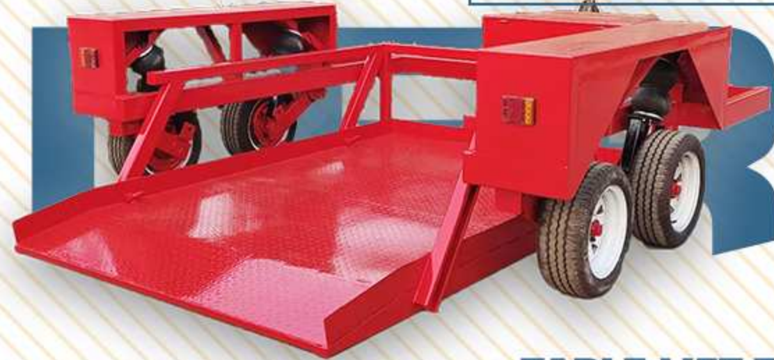
TABLE LIFT TRAILER