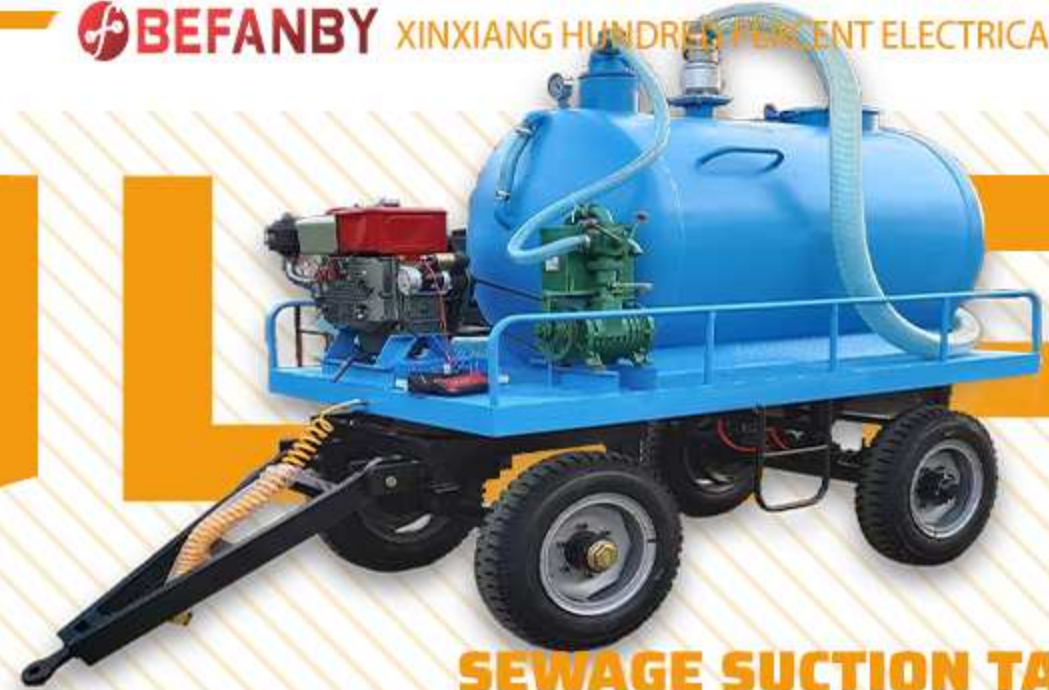
SEWAGE SUCTION TANK TRAILER