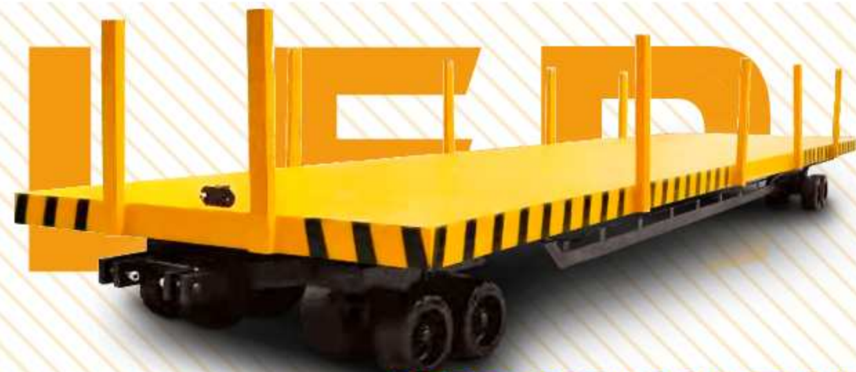
35T SUSPENSION TRAILER