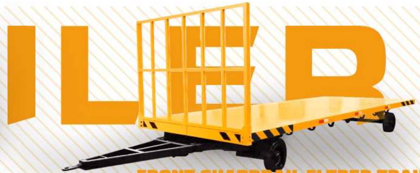
FRONT GUARDRAIL FLTBED TRAILER