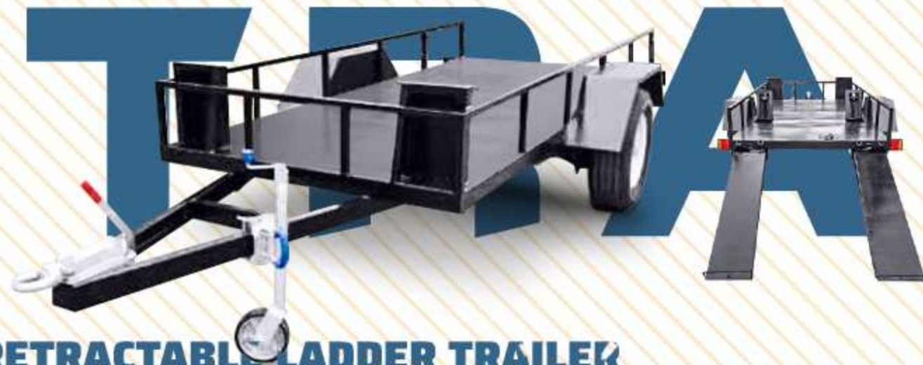
RETRACTABLE LADDER TRAILER