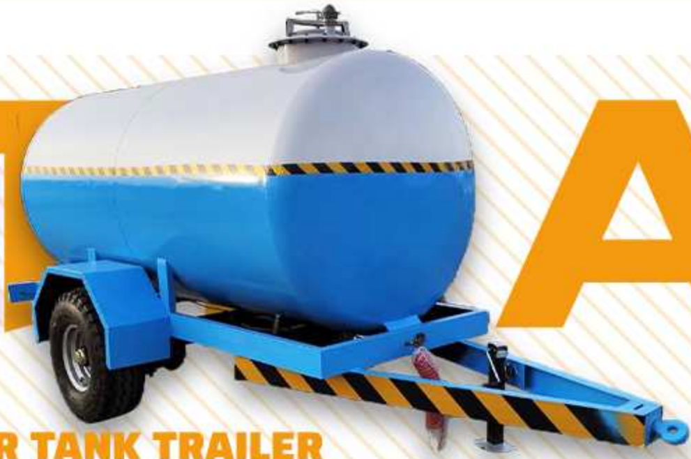
WATER TANK TRAILER