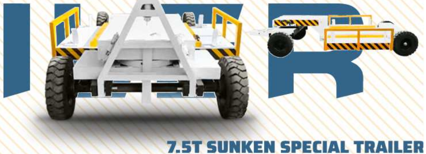
7.5T SUNKEN SPECIAL TRAILER