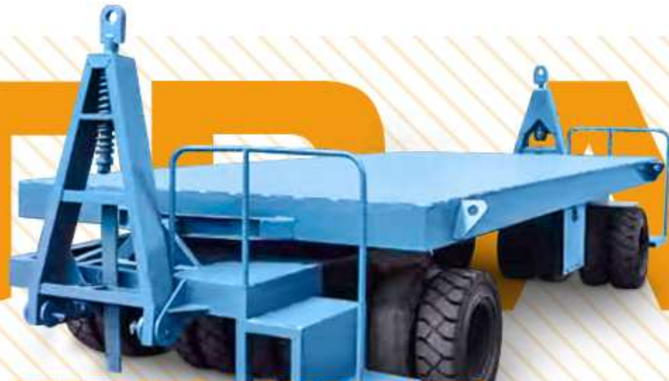
LINKAGE STEERING HEAVY-DUTY TWO-WAY TOW FLATBED TRAILERS