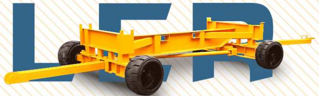
15T SKELETON STRUCTURE MILITARY TRAILER