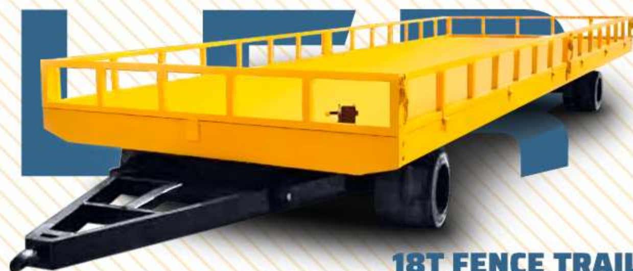
18T FENCE TRAILER