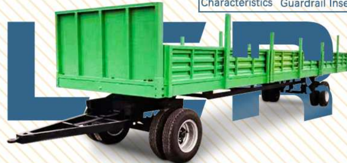
GUARDRAIL PILE TRAILER