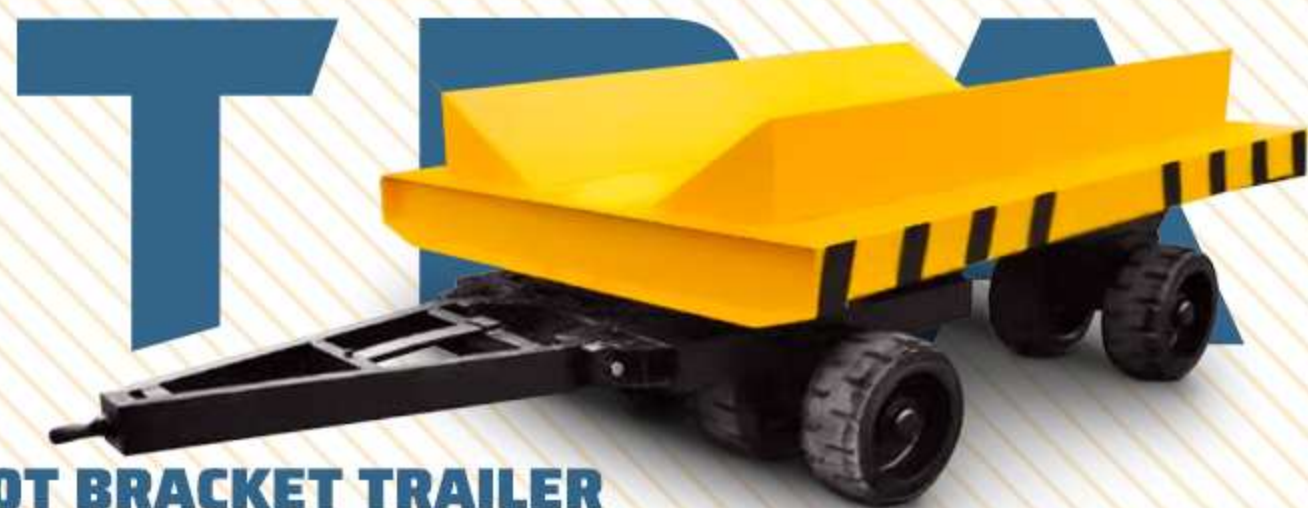
20T BRACKET TRAILER (COIL TRANSFER VEHICLE)