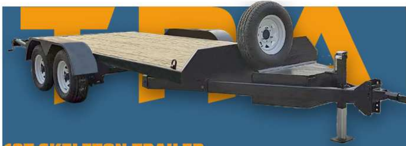
10T SKELETON TRAILER