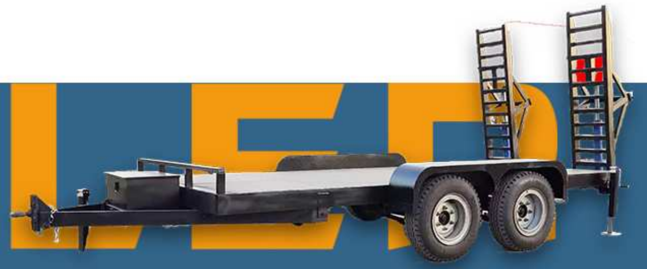
FLATBED CAR TRAILER

Skeleton trailer is made of longitudinal beam, beam and front and back end beam welded. Skeleton trailer no power, heavy load, safe use, affordable and other characteristics. Suitable for industrial heavy cargo transport turnover, workshop, industrial area, cargo yard short distance transport, etc.