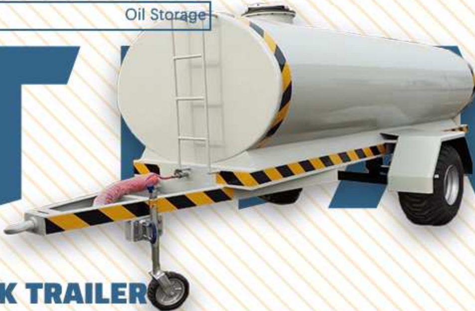
OIL TANK TRAILER