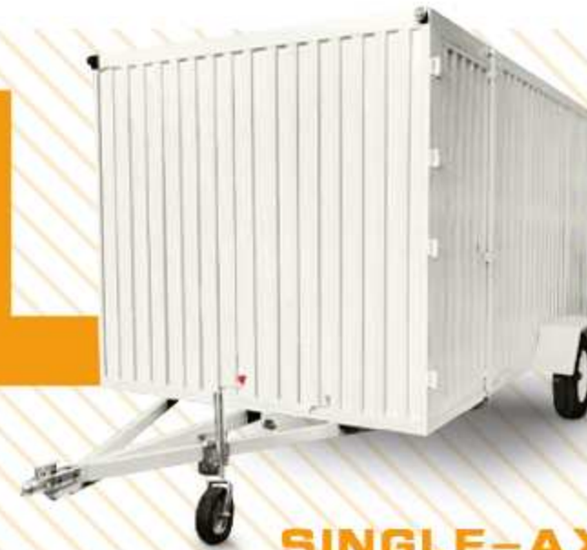
SINGLE-AXIS BOX TRAILER