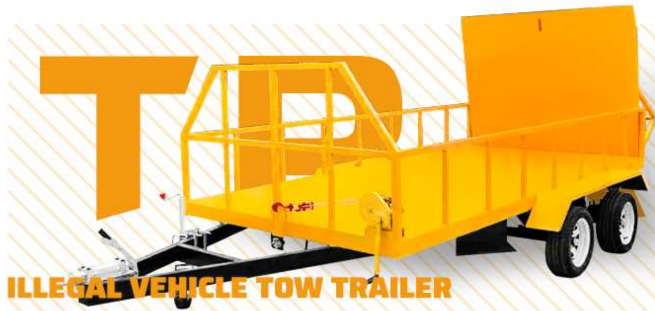
ILLEGAL VEHICLE TOW TRAILER