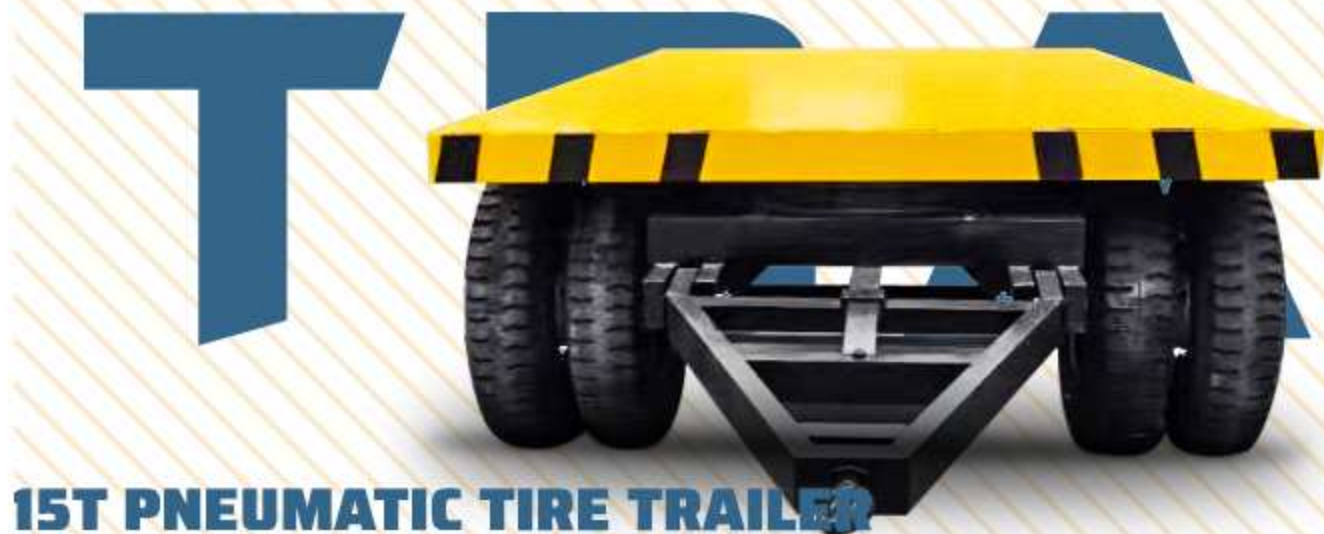
15T PNEUMATIC TIRE TRAILER