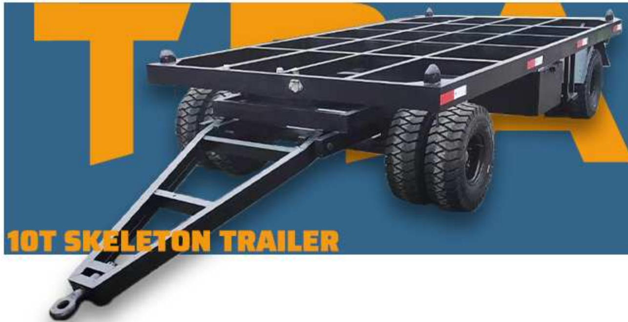
10T SKELETON TRAILER

Skeleton trailer is made of longitudinal beam, beam and front and back end beam welded. Skeleton trailer no power, heavy load, safe use, affordable and other characteristics. Suitable for industrial heavy cargo transport turnover, workshop, industrial area, cargo yard short distance transport, etc.