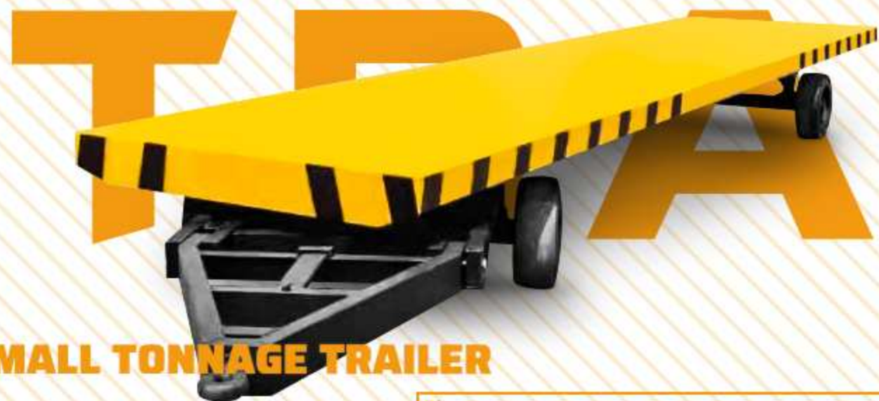
SMALL TONNAGE TRAILER